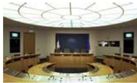
From The Committee Room

Didn't get one for Xmas? - Try the January Sales