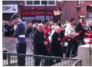
LSH Chairman lays our wreath

"... people should be able to choose where they get married or have a civil ceremony. If they're religious they should be able to have their service recognised ... in a religious setting."