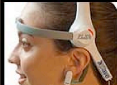
The app that can read your mind