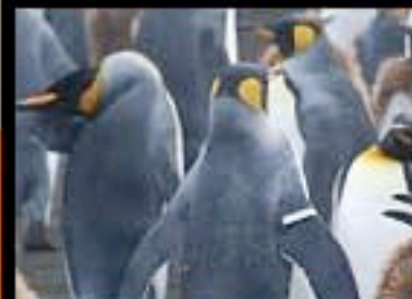
Penguins with metal bands 'die faster'