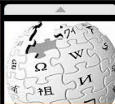
Wikipedia celebrates its 10th birthday

Astronomers have called for the zodiac signs to be overhauled because they are no longer accurate. They want to introduce a 13th star sign, Ophiuchus.