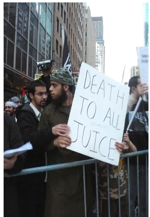
Dyslexia Rules K.O.